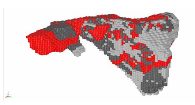
Resource block model, created in Surpac 6.7, which is colored by material class: waste, low grate, high grade.

At the heart of the strikingly improved block model processing is the multi-threaded technology that allows the majority of block modeling functions to use all available processors or cores. The effect of using all available cores is that users can now expect up to a 95% reduction in processing times for block model operations such as estimations, block maths, constraining, and reporting. As well, up to 200 times performance improvement for inverse distance, ordinary and simple kriging, and nearest neighbor estimations.